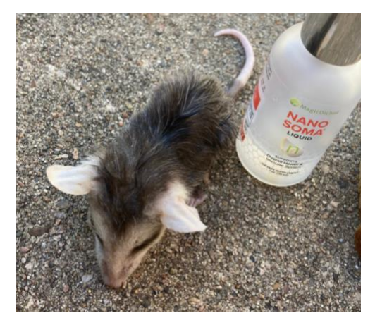
An orphaned opossum reviving after NANO SOMA

To read more testimonials about how the MagicDichol Family of Products has supported both animals and humans, <u>click here.</u>