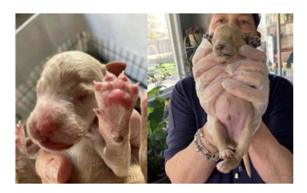
Hypoglycemic puppy after NANO SOMA

"I had a litter of puppies and one was born hypoglycemic, with blood-red paws, face etc. Instead of using high fructose corn syrup to bring the glucose levels up, I used .75 mL of NANO SOMA. I put it on the puppy's lips and watched in awe as the pigment began to fill in the blood-red places. The puppy is developing normally with proper weight gain, nursing beautifully, and seems content. He looks just like his nine siblings now, six days later."