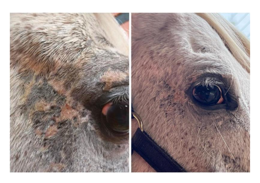
Before & after three weeks with the METASOMER Topical Gel

This horse had a skin issue for eight years. Note the vast improvement after <u>just three weeks</u> with the METASOMER Topical Gel – essentially NANO SOMA with edible Xanthan gum added.