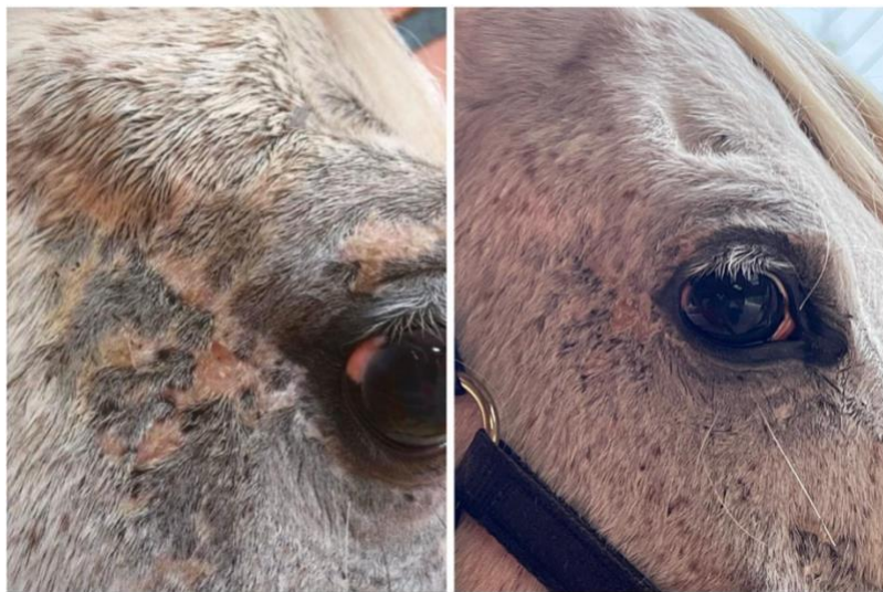
Before & after three weeks with the METASOMER Topical Gel

This horse had a skin issue for eight years. Note the vast improvement after just three weeks with the METASOMER Topical Gel – essentially NANO SOMA with edible Xanthan gum added.