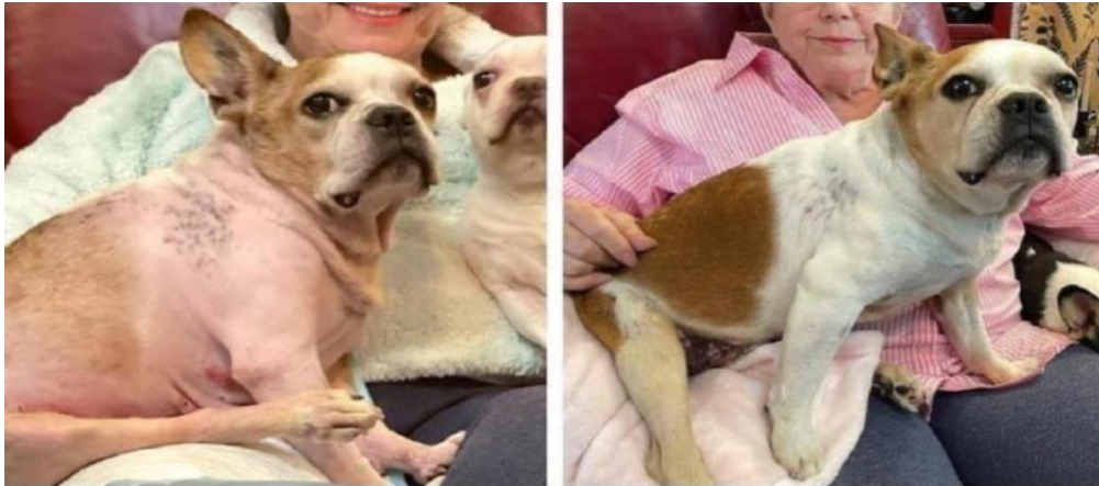
Before & after two months on NANO SOMA

Above, one customer's 14-year-old dog, Eddie, experienced a transformation of his skin after approximately two months with NANO SOMA.