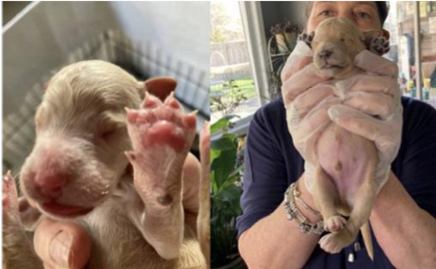
Hypoglycemic puppy after NANO SOMA

“I had a litter of puppies and one was born hypoglycemic, with blood-red paws, face etc. Instead of using high fructose corn syrup to bring the glucose levels up, I used .75 mL of NANO SOMA. I put it on the puppy’s lips and watched in awe as the pigment began to fill in the blood-red places. The puppy is developing normally with proper weight gain, nursing beautifully, and seems content. He looks just like his nine siblings now, six days later.”