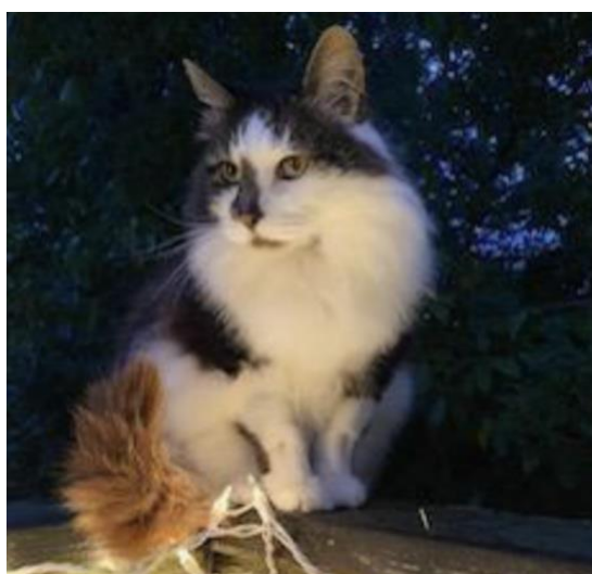
Joey after taking NANO SOMA

“The transformation of my cat 'Joey' has shaken my world. Joey is 15 years old and has been declining in health for the last few years... Ten days ago, Joey appeared to have what might be considered a stroke or was in a coma. He was in an upstairs bedroom in a frozen state, lying on his stomach with his head between his paws. He was immobile for two hours. I moved him to a couch in the middle of the night where I gave him spine massages until the morning.